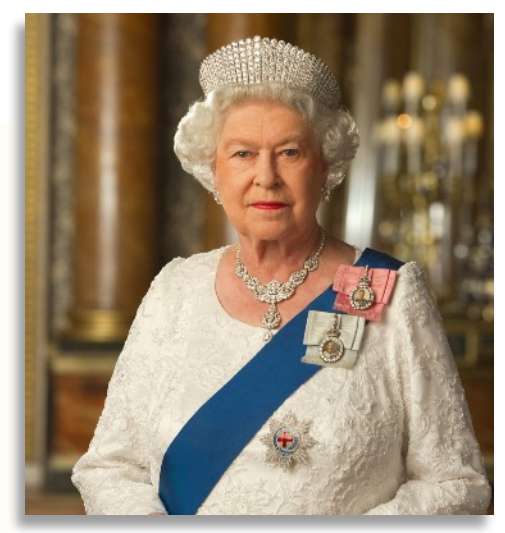
Patron of Mothers' Union

"Your long history tells us that circumstances may change, but the needs of human beings in households and families do not."