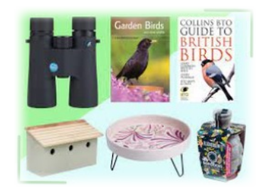
Available from RSPB

Looking ahead, as more chicks hatch and the flora around the reserve matures, we welcome back dragonflies, damselflies and butterflies. It won't be long until the small, but beautiful purple hairstreak butterflies emerge. On a warm, sunny day it's fun to see if you can spot them out on the oaks close to the visitor centre. Along the trails look out for the delicate orchids that are scattered around including bee, southern marsh and pyramidal orchids.