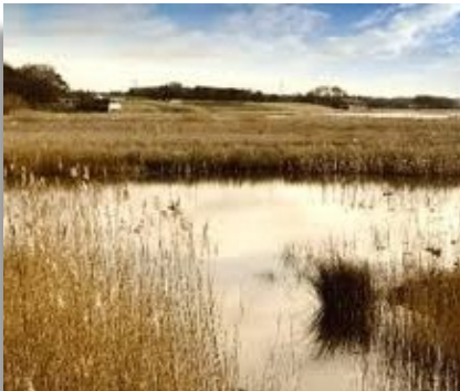
Burton Mere Wetlands

heading south and using the reserve to rest and refuel; a variety of sandpipers and ‘shanks’ are already stopping by and will continue to do so through the next few months, each individual only stopping for a short time before continuing its long journey.