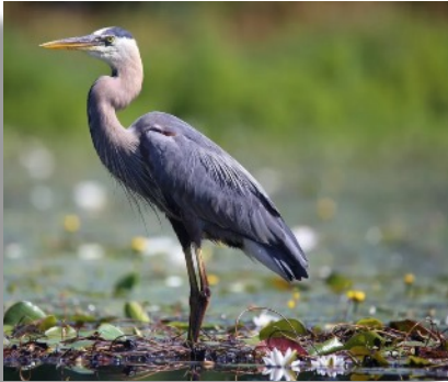
Wading Birds Cranes - Egrets - Herons etc