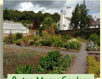
Burton Manor Gardens

The Friends of Burton Manor Gardens is a registered charity dedicated to restoring and maintaining the gardens and grounds around the Manor. The gardens, located in the centre of Burton Village, are open daily between 10.00am and 4.00pm and until 6.00pm between April and mid-October, with free admission.