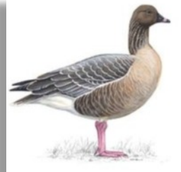
Pink Footed Goose