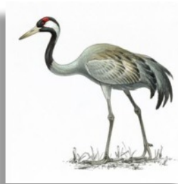
Wading Bird - the Crane

October is a prime time for wader migration, with a variety of 'shanks', stints and sandpipers to be found around Burton Mere Wetlands. The earlier sunsets mean it's much easier to enjoy the spectacle of hundreds of egrets flying in to their night-time roost around the Mere.