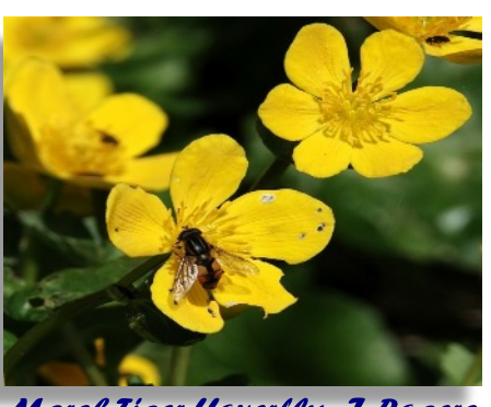
Marsh Tiger Hoverfly